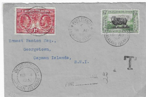
From Port Stanley, Falkland Islands: Postmark dated 16 AU 33, with Falkland 'Deficient Postage' handstamp. The cover reached Georgetown on NO 14 1933 and had the Centenary 1d added to pay double the 1/4d deficiency.