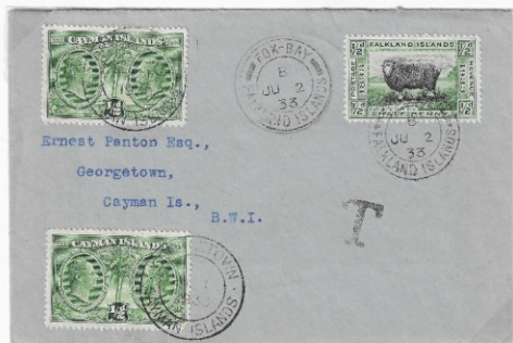
From Fox Bay, Falkland Islands: Postmark dated JU 2 33. The cover reached Georgetown at AU 1 1933 and had 2 of the Centenary 1/4d added to pay double the 1/4d deficiency.