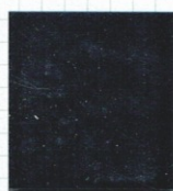
(S) TYPE 17