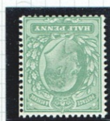
2A INV. WMK (EX BOOKLET)