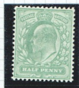
1. PALE YELLOW -GREEN