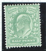
2. YELLOW- GREEN