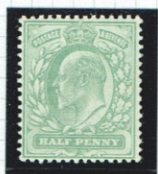
1. PALER SHADE